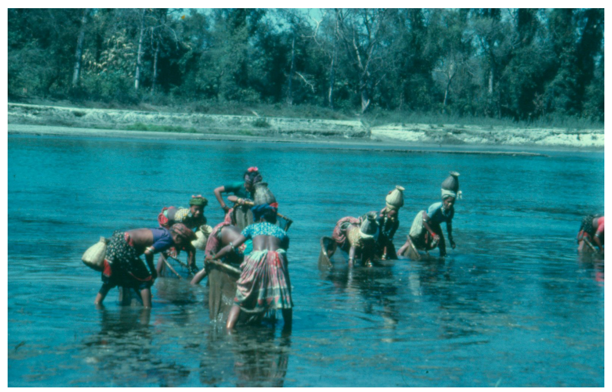
Tharu women fishing in the Chitwan area of Nepal. Ramsar Criteria 7 and 8 recognize the importance of wetlands as fish habitats.

wetland. In addition, the different ecological roles that species may play at different stages in their life cycles needs to be considered.