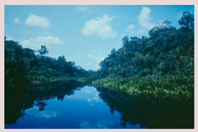
Berbak National Park and Ramsar Site in Indonesia - a 160,000-hectare, largely undisturbed peat swamp forest where a full wetland inventory has been carried out.

Action 6.1.3 of the Ramsar Convention Strategic Plan adopted at the 6th COP in Brisbane, Australia, in 1996, sought to encourage the use of regional wetland directories, national scientific inventories and other sources to begin to quantify the global wetland resource. This would be used as a baseline for monitoring trends in wetland conservation and loss. In response, the Ramsar Convention Secretariat, with funds provided by the UK, engaged Wetlands International to prepare a Global review of wetland resources and priorities for wetland inventory for the Convention's COP7 and a summary of this review was tabled at the meeting as COP7 DOC. 19.3. This document is available from the Secretariat's website at http://www.ramsar.org/cda/ramsar/display/main/main.jsp?zn=ramsar&cp=1-31-58-83^18751_4000_0__.