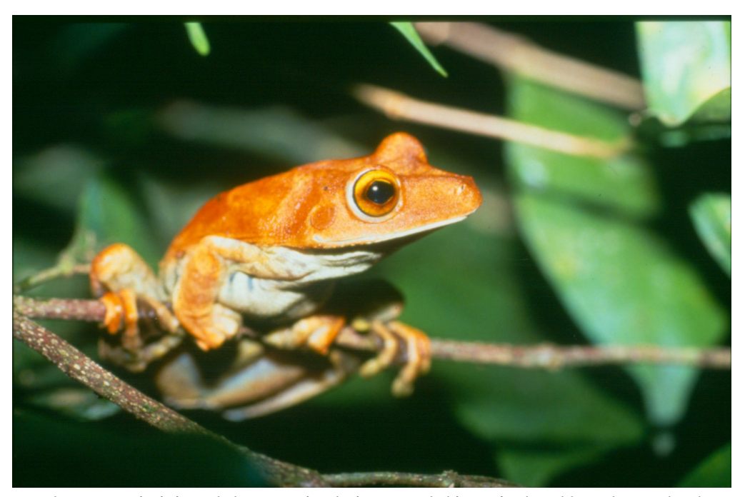
The Ramsar List is intended to recognize the important habitats of vulnerable, endangered and critically endangered species; this is vital, for example, for the world's declining frog populations, as this Hyla rainette in French Guyana.

waterbirds and other mobile species and where the patterns of such dynamic use are insufficiently known; or