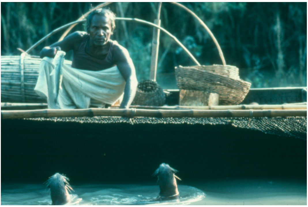
In Bangladesh, the Sundarbans mangrove forest is both a World Heritage and a Ramsar Site. Parties to the Ramsar Convention are urged to ensure that all of their internationally important wetlands are Ramsar-listed in addition to the recognition of these sites under other instruments. Above: a fisherman with his trained otters.