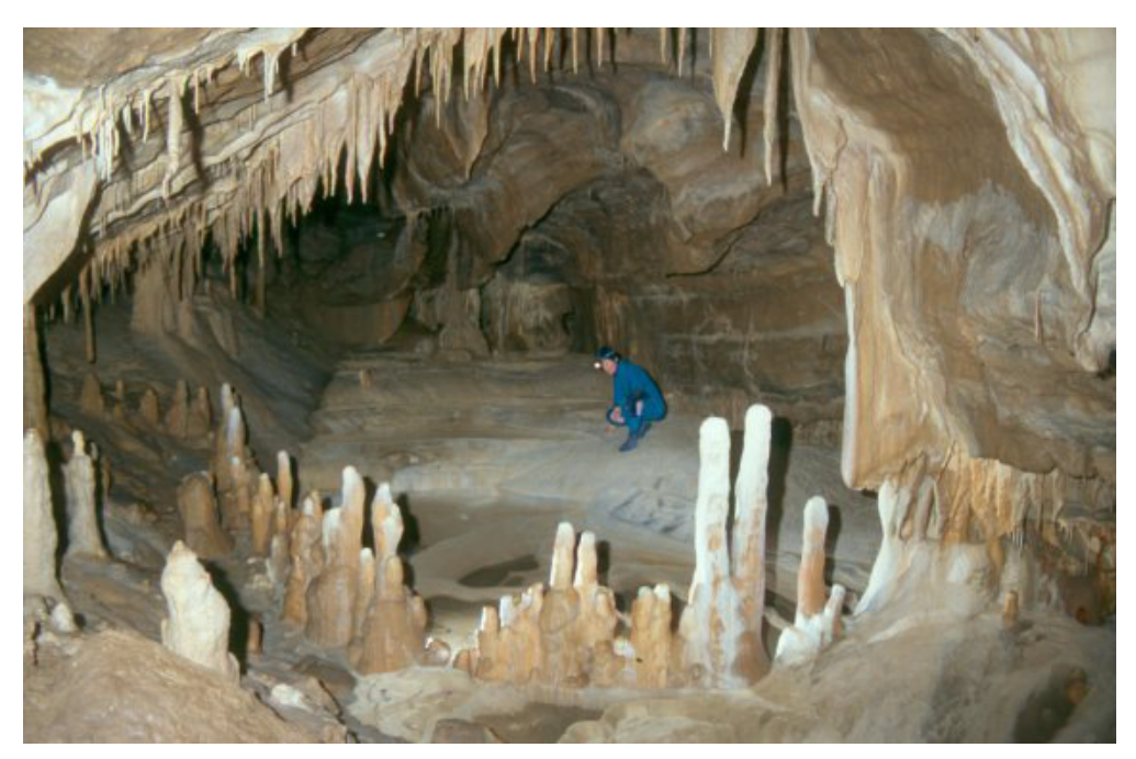
The Grotte des Émotions in Belgium, added to the Ramsar List in 2004.

of drinking water, water for grazing animals or agriculture, tourism and recreation. Karst wetland systems may play an especially vital role in ensuring adequate water supplies for human communities in generally dry surface landscapes.