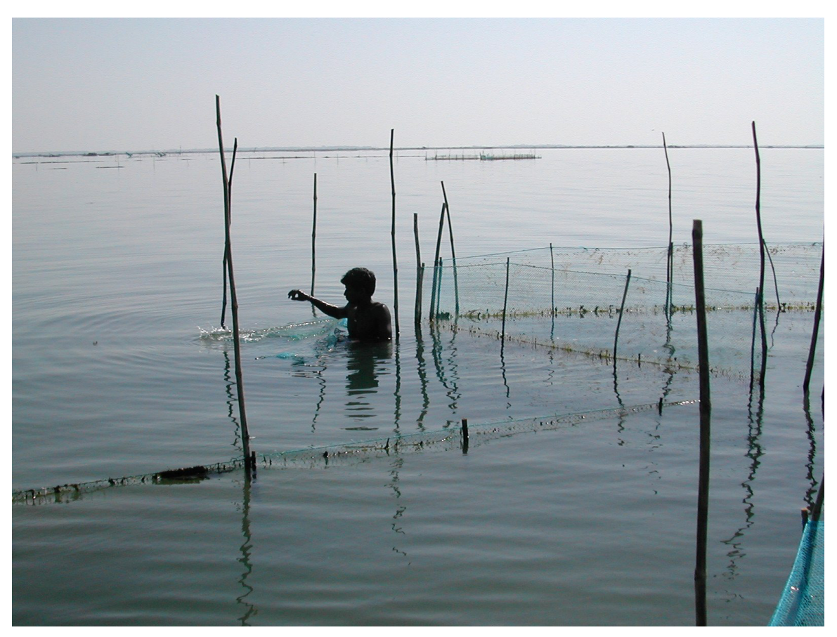
Fisherman and nets, Chilika Lake Ramsar Site, India.

heterogeneous and unpredictable the habitats, the greater the biodisparity of the fish fauna. For example, Lake Malawi, a stable, ancient lake, has over 600 fish species of which 92% are maternal mouthbrooding cichlids, but only a few fish families. In contrast, the Okavango Swamp of Botswana, a palustrine floodplain that fluctuates between wet and dry phases, has only 60 fish species but a wider variety of morphologies and reproductive styles, and many fish families, and therefore has a greater biodisparity. Measures of both biological diversity and biodisparity should be used to assess the international importance of a wetland.