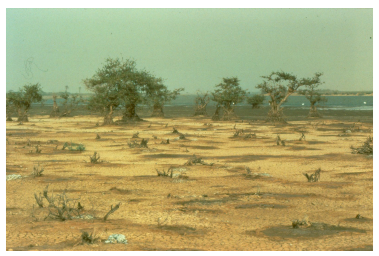
The Ramsar Convention discourages policies, laws, and attitudes that allow unsustainable actions such as this: the aftermath of mangrove destruction.

27. The Introduction to this Strategic Framework states that its purpose is to provide a clearer understanding, or vision, of the long-term targets or