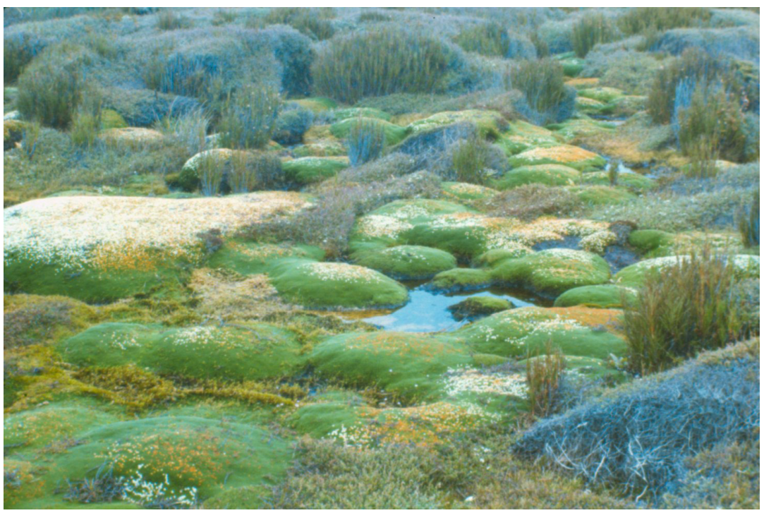
Peatbogs, such as this one in New Zealand, are among the wetland types that are poorly represented in the List of Wetlands of International Importance.

All Resolutions of the Ramsar COPs are available from the Convention's Web site at www. ramsar.org/resolutions. Background documents referred to in these handbooks are available at www.ramsar.org/cop7-docs, www.ramsar.org/cop8-docs, www.ramsar.org/cop9-docs, and www.ramsar.org/cop10-docs.