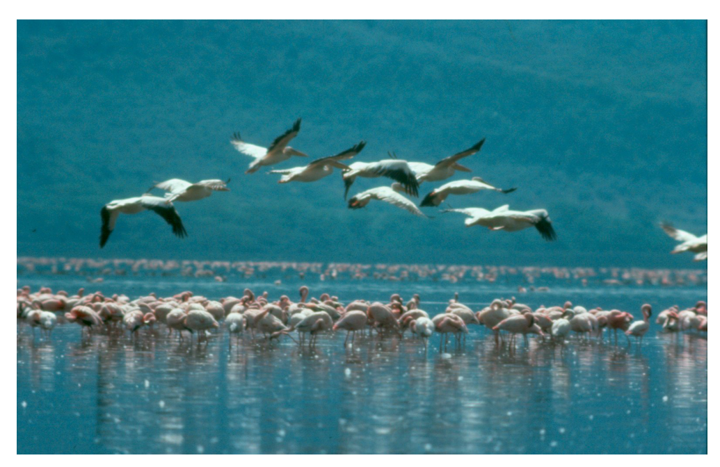
Pink Flamingos and Great White Pelicans at Lake Nakuru, Kenya. Ramsar Criteria 5 and 6 recognize the importance of wetlands for waterbird populations.

containing globally threatened species or subspecies. These are currently poorly represented in the Ramsar List. (Refer also to paragraph 53 above, "Species presence in perspective".)