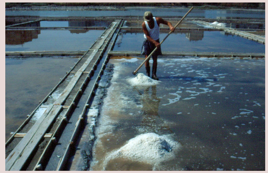
A traditionally managed saltpan in the Pomorie Ramsar Site in Bulgaria.

artificial wetlands - increasingly important with reservoirs, dams, salinas, paddy, and aquaculture ponds important in many regions, notably Asia, Africa and the Neotropics, where they can provide habitat for wildlife, particularly migratory birds. Under some circumstances they provide many values and benefits to humans and can partially compensate for the loss and degradation of natural wetlands."