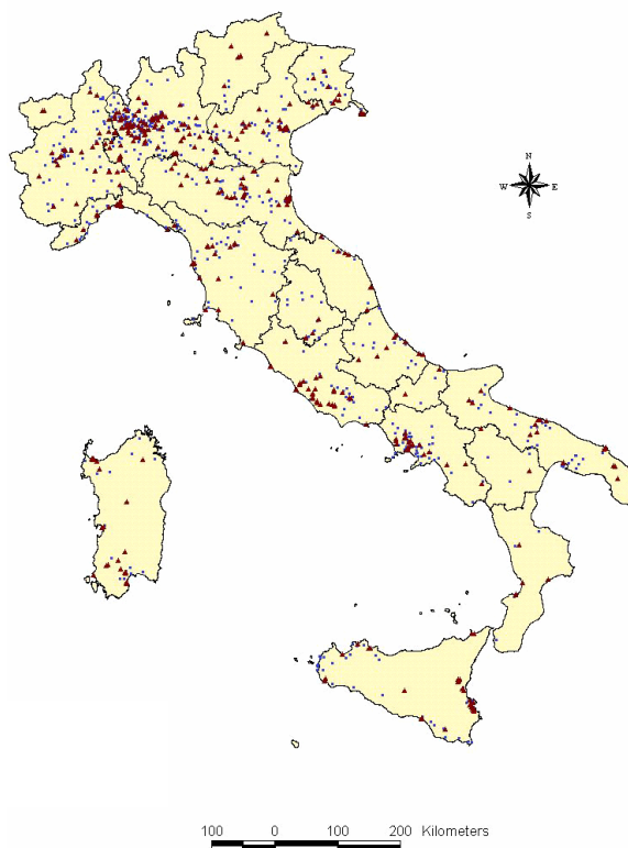
Figure 1 – Industrial establishments subject to law 334/99

The risk of industrial accidents triggered by (and combined with) floods is concentrated in plains such as the Po river plain, where major settlements are located and severe floods are possible. The Po basin –